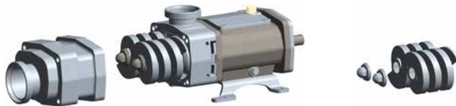
1. Removal of pump casing and cover

individual adaptation to system requirements. Furthermore, it is specifically configured for easy access and maintenance. The FDS offers maximum efficiency with extremely tight internal clearances.