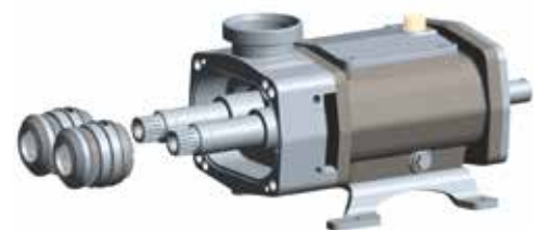
4. Exchange of mechanical seals