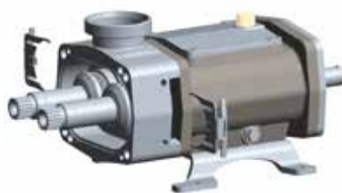
3. Unlocking of item keys